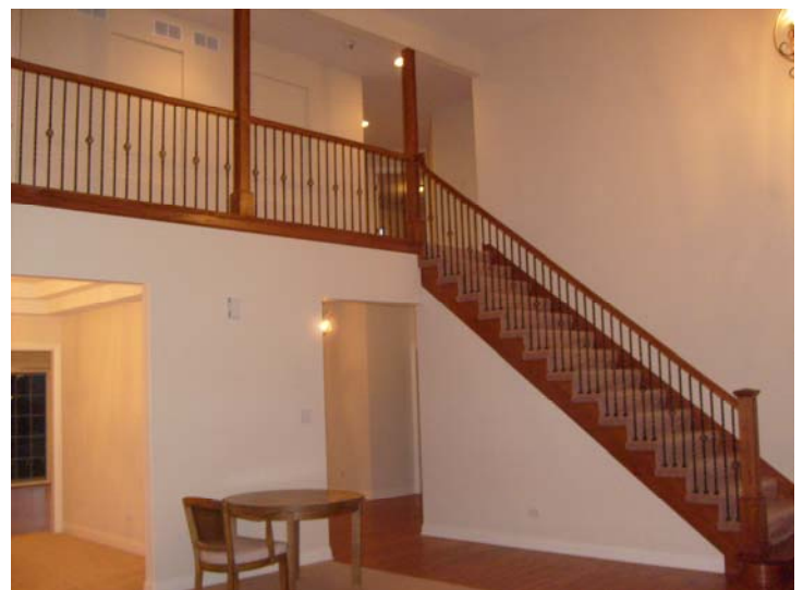
Living Room with iron and wood railings