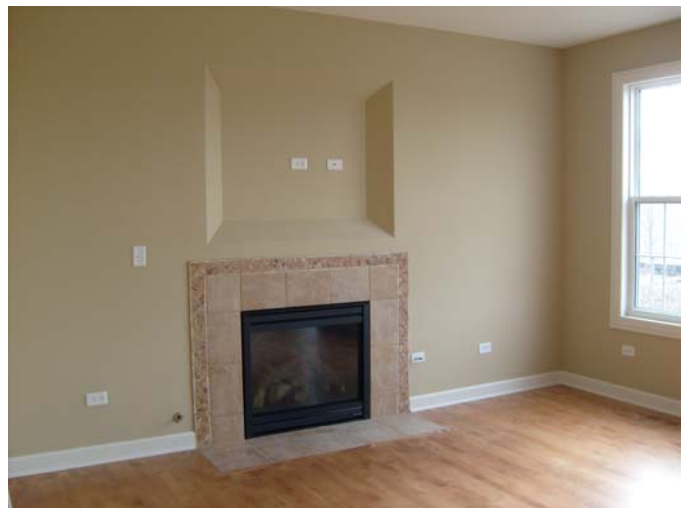
Family Room Fireplace ready for your Plasma TV