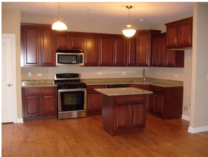
Kitchen With Granite Countertops