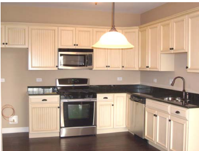
Kitchen With Granite Countertops