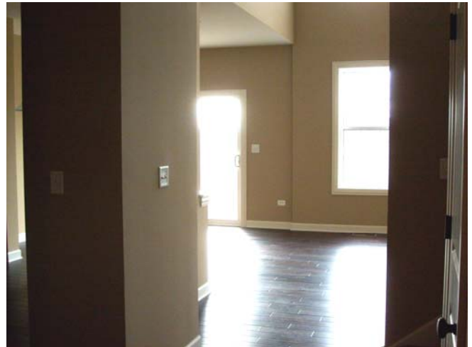
View from Entry