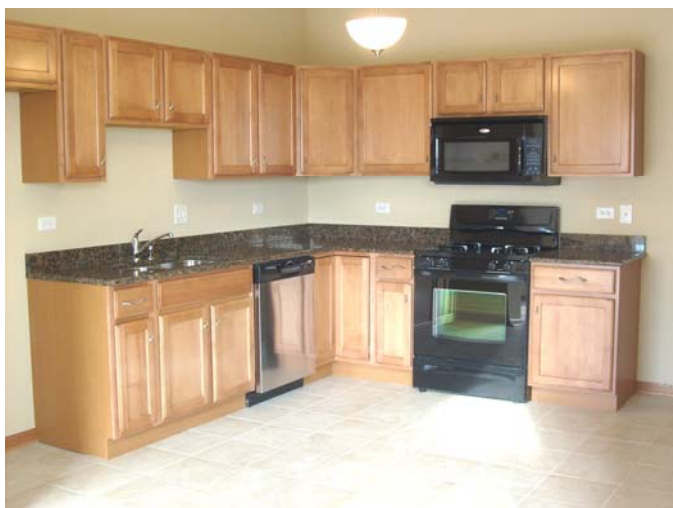
Kitchen With Granite Countertops