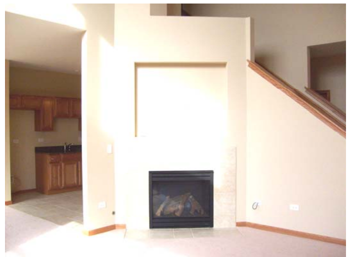
Family Room Fireplace ready for your Plasma TV